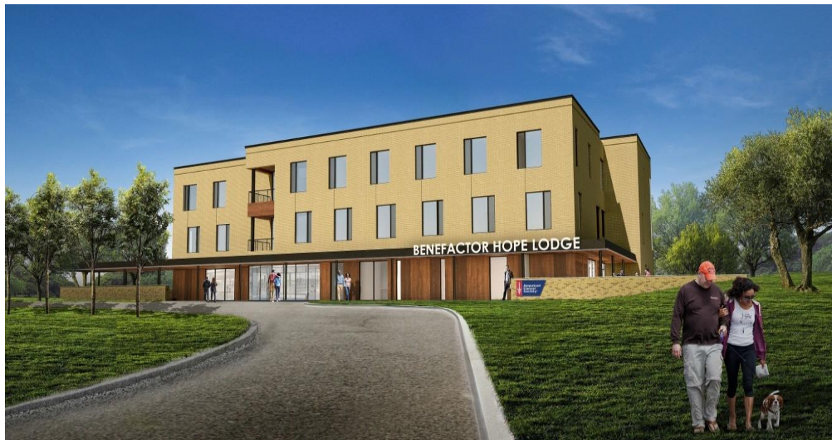
Rendering 1: View from Entry Drive

Staff Recommendation: The Attorney General's Office has reviewed and approved this item. Board staff recommends approval of this item.